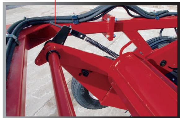
Tension Adjustment Rod

The pick-up head crop roller is adjustable for height and tension, and helps to create a smooth, even pick-up of material.