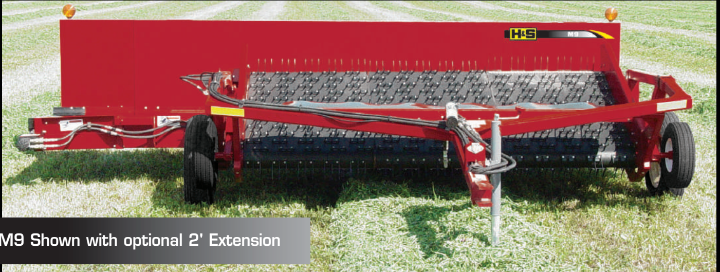
M9 Shown with optional 2' Extension

The optional 2' extension allows you to merge up to 14' cuts of hay windrowed up to 9' on the M9 Merger.